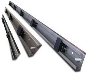
CHAIN CROSSBAR SV-380