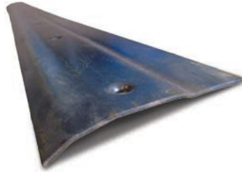
SEAL PLATE SV-020