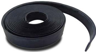
CONVEYOR SEALS SV-027