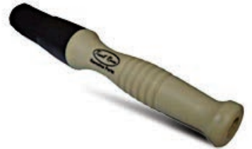
OILER BRUSH SV-019