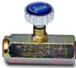
OILER VALVE, SV-115