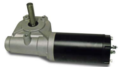
TARP MOTOR, SV-067 (M)

> Contact your local Rush Truck Centres of Canada location for pricing