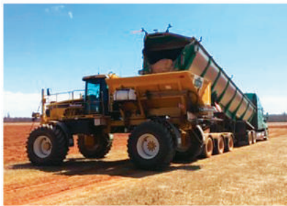
Rear Lift Live Bottom