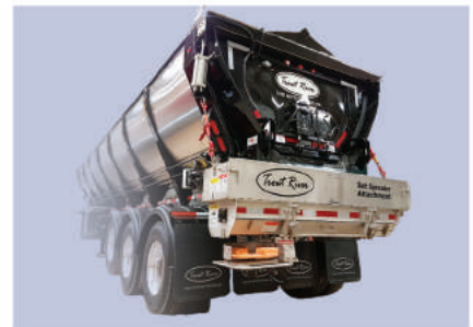
Salt Spreader Attachment