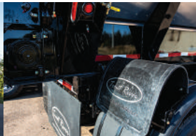
Pneumatic Mud Flaps