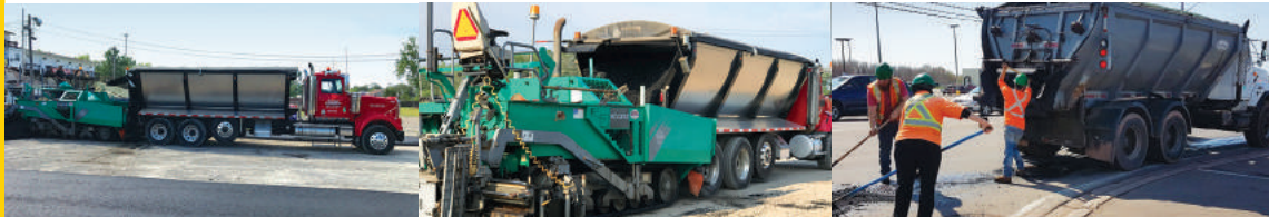
Safer Than A Dump